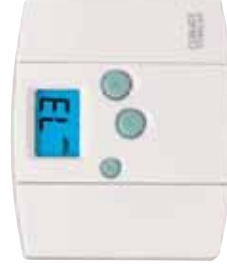
43054 Digital Thermostat

Precise • Quality • Reliable • Innovative