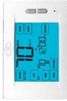
84210T Ultimate Series Thermostat