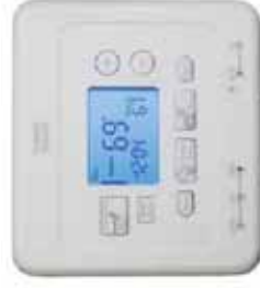
53200 5/1/1 Day Programmable Thermostat