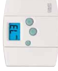
43054 Digital Thermostat

Precise • Quality • Reliable • Innovative