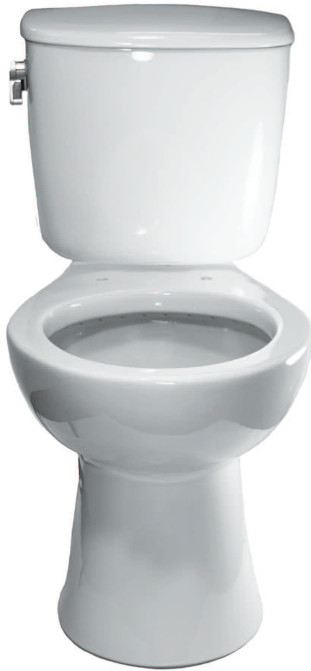
Left Handle Model Shown