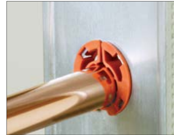
E84 PipeEye™ Metal Stud Insulators have a 1-11/32 O.D. and are compatible with Copper, PEX or CPVC in sizes ranging from 1/2" through 1" CTS.