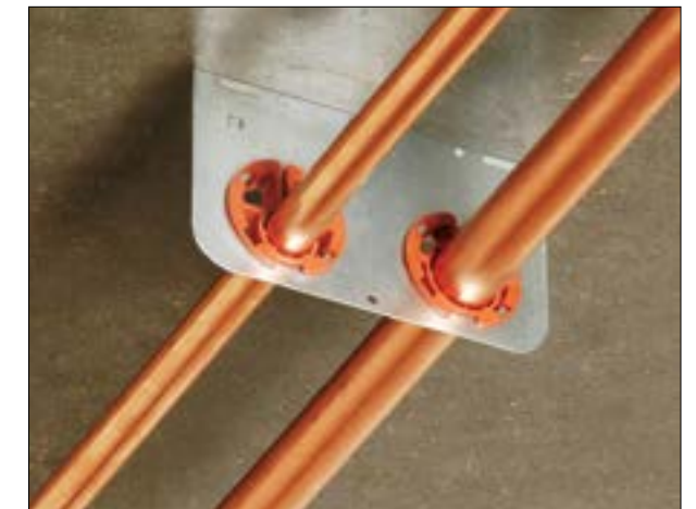
PipeEye Suspension brackets are designed with the same 1-11/32" hole as a standard metal stud punch for use with PipeEye grommets. Secure the brackets directly to ceilings, decks, walls or vent pipes for tight installations where space is limited.