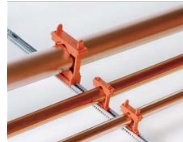
E84 TouchDown clamps and TouchDown II clamps fit PowerBar and PowerBar Mini Strut brackets. The releasable locking mechanism allows for variable clamping tension for expansion and contraction. Clamping ranges are 1/2" - 2" CTS or 3/8" - 2" IPS (Schedule 40).