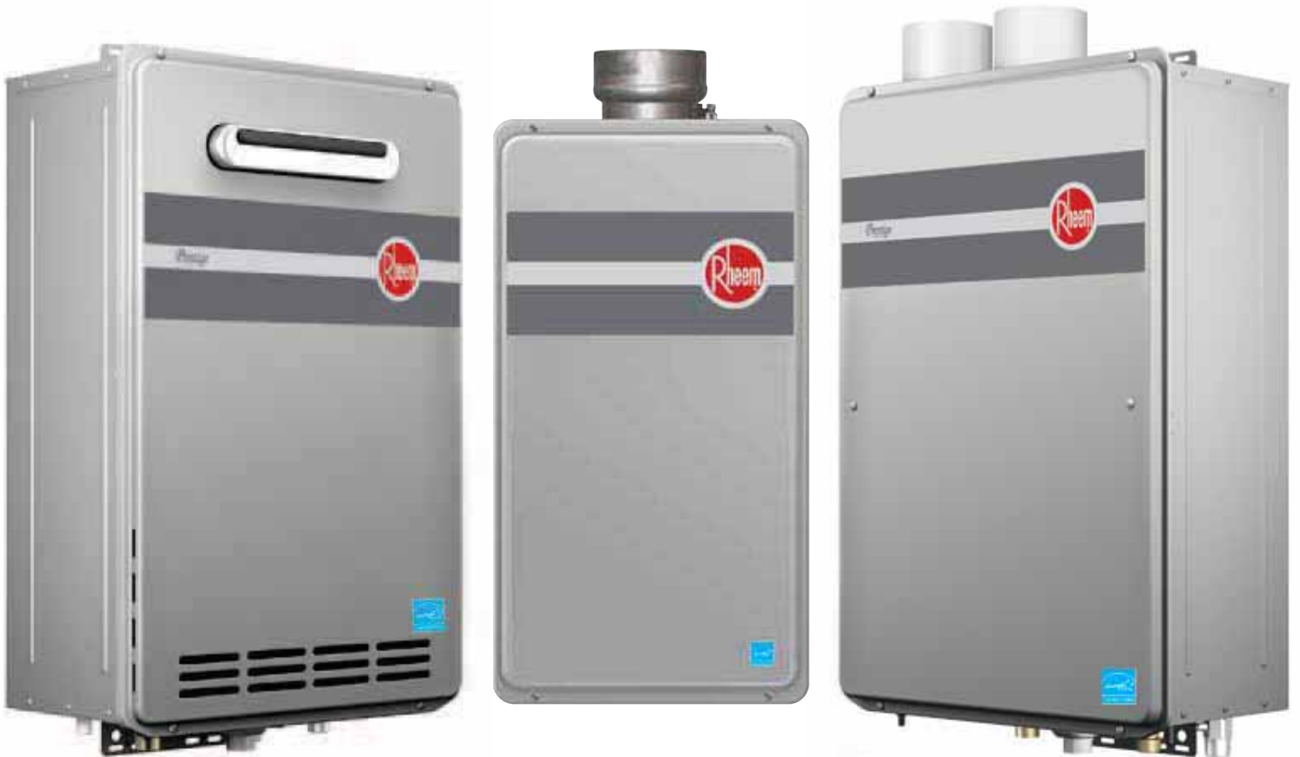
Indoor and Outdoor Tankless Gas Water Heaters