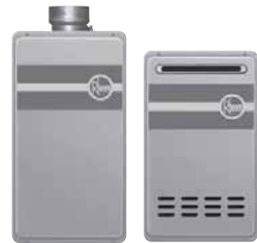
RTG-95 and 84 Indoor Direct Vent and Outdoor models

* See Warranty Certificate for complete information.