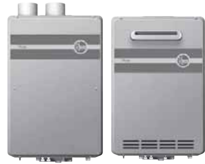
RTGH-95 and 84 Indoor Direct Vent and Outdoor models