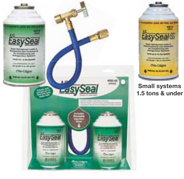
Small systems 1.5 tons & under

In most cases, one can will seal systems that have lost all refrigerant in as little as seven days and is designed for large systems up to 5 tons. For systems 1.5 tons to fractional, use A/C EasySeal-SS.