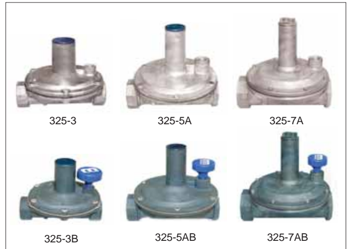
Figure 1: 325 Series Appliance Regulators