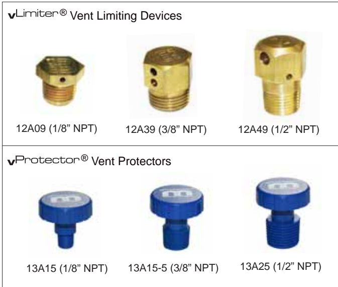
Figure 3: Vent Accessories

vLimiter® Vent Limiting Device for Indoor Applications: 325-3(B) .....12A09 325-5A(B) .....12A39 325-7A(B) .....12A49