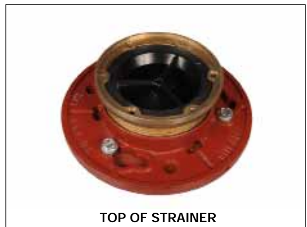
TOP OF STRAINER