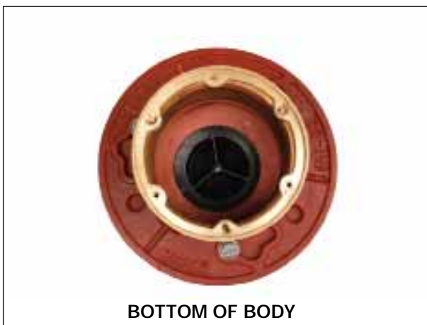
BOTTOM OF BODY