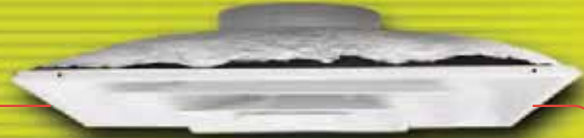
Both 2-cone and 3-cone Diffusers feature an innovative cone design that is adjustable to allow sleek flush look, or can be pulled into the extended position for maximum air flow.