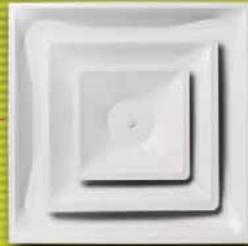
Light Commercial 2x2 Diffuser 2-Cone Available with 6", 8", 10" or 12" collar Order with or without Insulation