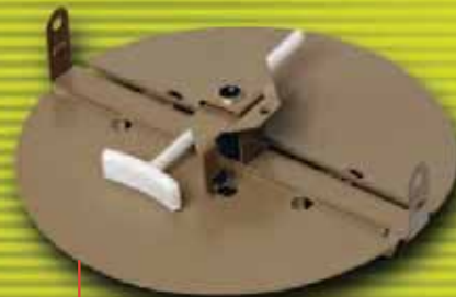
Butterfly Damper features smooth operation and guide tabs for quick attachment to Diffuser. 6", 8", 10", 12" dia.