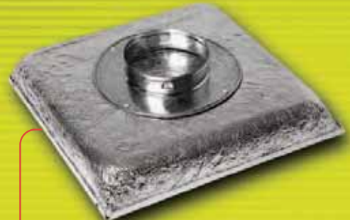
Collar Ring for Perforated Diffuser provides easy connection of flex duct. 6", 8", 10", 12" dia.

Call today for complete information! 800-835-2830 www.metal-fabinc.com