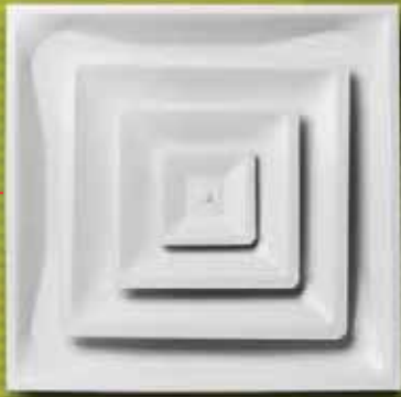
Light Commercial 2x2 Diffuser 3-Cone Available with 6", 8", 10" or 12" collar Order with or without Insulation