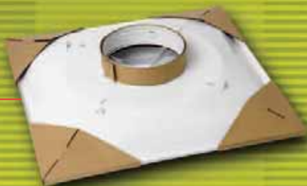
Diffusers are individually packaged with additional corner pad and collar protection.