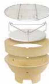
Roasting “Bottom” configuration.