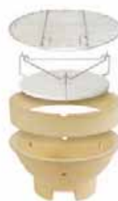
Roasting "Bottom" configuration.