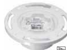
U.S. Patent No. 7,350,243