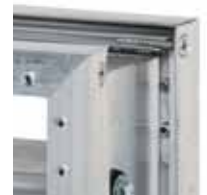
Durable construction — riveted and screwed corners.