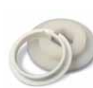
Two-piece bearing for long life and quiet operation.