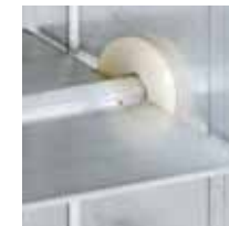
Parallel blade with extruded lip for low leakage.