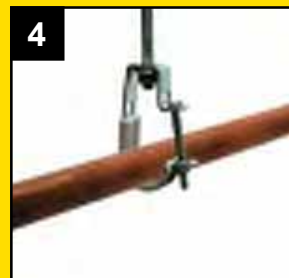
4 Install Complete