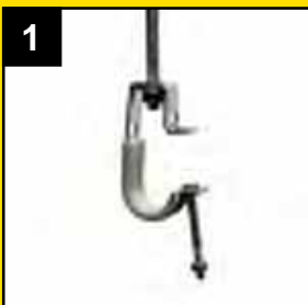
1 Easy Side Entry