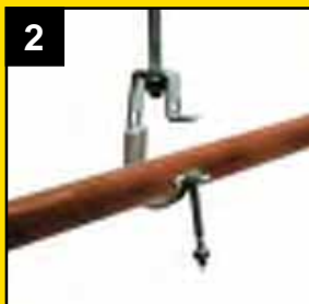
2 Load Pipe