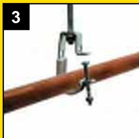
3 Latch Bolt