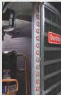
Goodman's SMARTCOIL 5mm tube condensing coil design optimizes the heat transfer ability of R-410A refrigerant compared to standard 3/8" copper tubing.

We know that the last thing you want to hear at night is a noisy heat pump starting up. So, we build our Goodman brand GSZ13 Heat Pumps with sound-dampening features that help ensure that your cooling system doesn't interfere with a good night's sleep. We rely on a quiet condenser fan system – a three-bladed fan and a unique louvered sound-control top – to reduce fan-related noise. Your Goodman brand GSZ13 Heat Pump will keep your home cool and comfortable, year after year.