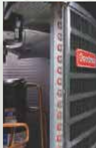
Goodman's SMARTCOIL 5mm tube condensing coil design optimizes the heat transfer ability of R-410A refrigerant compared to standard 3/8" copper tubing.

We know that the last thing you want to hear at night is a noisy air conditioner starting up. So, we build our Goodman brand GSX13 Air Conditioners with sound-dampening features that help ensure that your cooling system doesn't interfere with a good night's sleep. We rely on a quiet condenser fan system – a three-bladed fan and a unique louvered sound-control top – to reduce fan-related noise. Your Goodman brand GSX13 Air Conditioner will keep your home cool and comfortable, year after year.