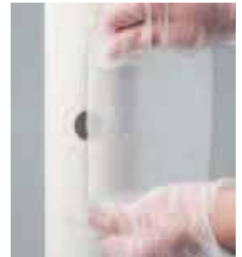
PATCH IT and REPAIR IT!