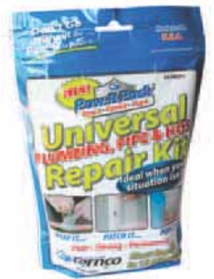
ONE CONVENIENT PACK!