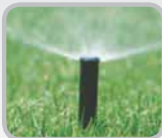
HOME / FARM