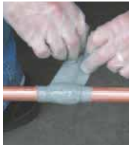
WRAP IT and REPAIR IT!