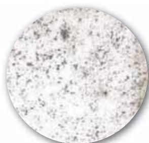
Standard plastic pan with visible mold

Microbes can double every 20 minutes on an untreated surface!